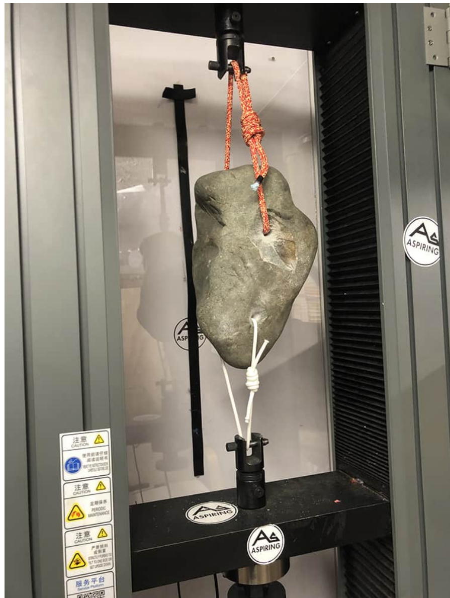
Rock Thread Testing

Part of the update work to the bolting COP was to test and evaluate screw anchors and rock threads. Screw anchors appear to be a promising option for temporary anchors, as they are easy to remove and the holes can be used for permanent solutions.