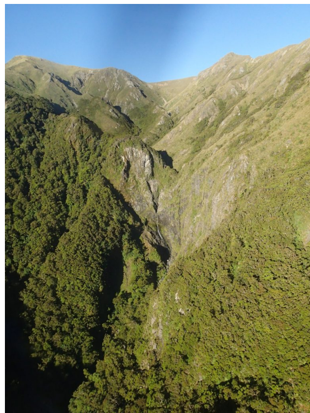
Isabelle Creek Headwaters Justin Hall

Lower North Island CanyonSAR have had only one near call out for an injured hunter but stood down due to successful heli extrication. Regardless, the Lower North Island Canyon SAR team are still committed to meeting, and training and have plans to implement skill currency over the next season.