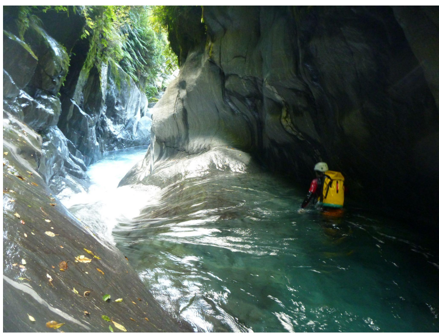
Griffin Creek, just above the proposed hydro intake

Federated Mountain Clubs of NZ (FMC) continues to advocate on our behalf over the hydro electricity proposal that threatens the Griffin Creek canyon.