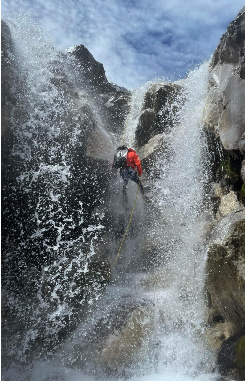
2021 FMC photo comp overall winner: Mangaturuturu Canyon by Gavin Barry-Morgan